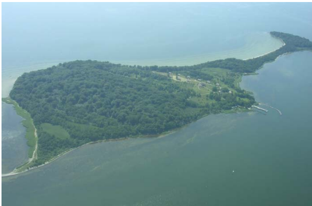
Vilm Island

The programme will take an integrated approach to the development of the personal capacity of early-career conservation professionals, by combining technical learning, management training and network development support. It will focus on individuals with outstanding leadership potential while promoting the participants' commitment and contribution to their home institutions.