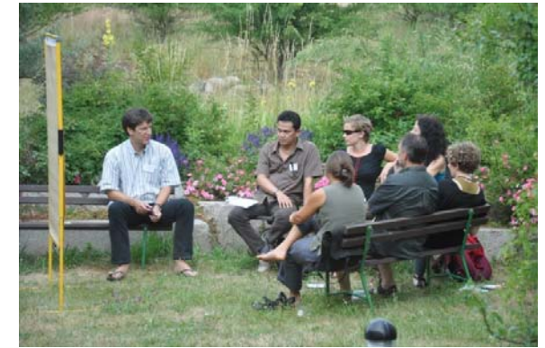
At the International Academy for Nature Conservation

The modules combine joint learning on key conservation topics (e.g. implementation of biodiversity related conventions, protected areas system development, resource mobilization for nature conservation) with management and leadership training.