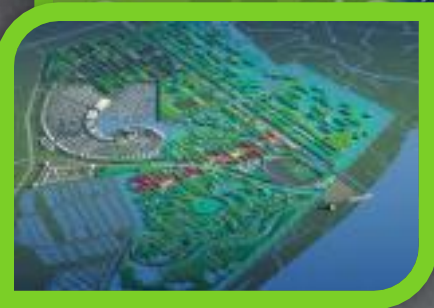
Dongtan Wetland Park (Chongming Island)