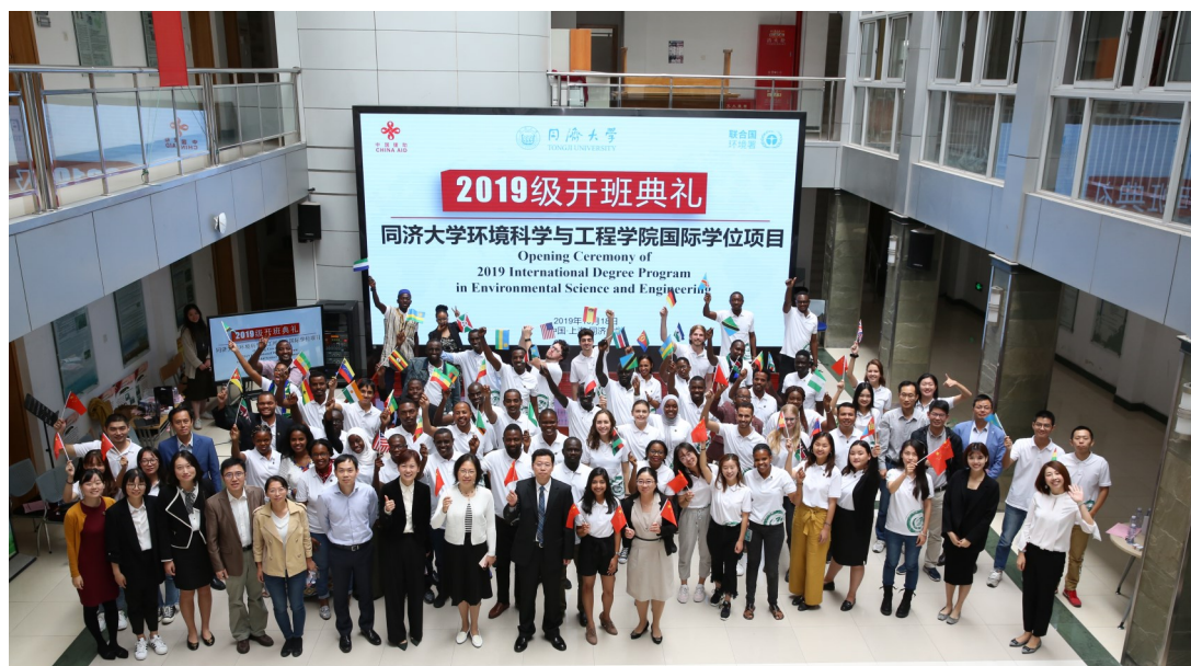
2019 Opening Ceremony of International Degree Program, 61 students from 33 countries.