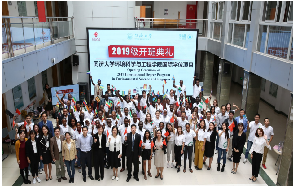
2019 Opening Ceremony of International Degree Program, 61 students from 33 countries.